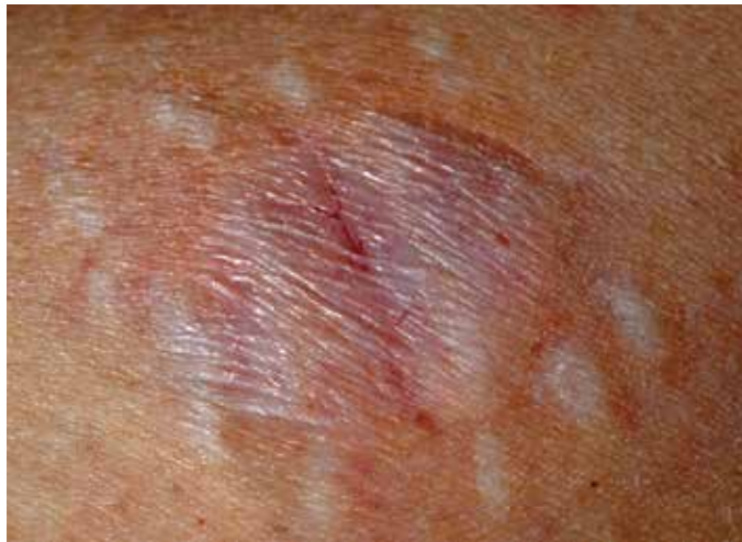
FIGURE 2 Bite of the Brown Recluse Spider