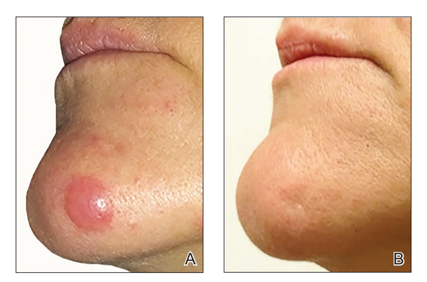
Figure 2. A 1.5-cm pink nodule of primary cutaneous anaplastic large-cell lymphoma on the left side of the chin before radiotherapy (A) and after low-dose radiotherapy (800 cGy total at each site)(B).

for each course of treatment was 20 Gy and 36 Gy, respectively, each administered over 2–3 weeks). Because new unsightly papulonodules continued to develop on the patient's face, she subsequently required low-dose oral MTX 30 mg once weekly for suppression of new lesions and was stable on this regimen for a year. However, she experienced an increase in LyP/pcALCL activity on the face during a 2-week break from MTX when she developed a herpes zoster infection on the right side of the forehead.