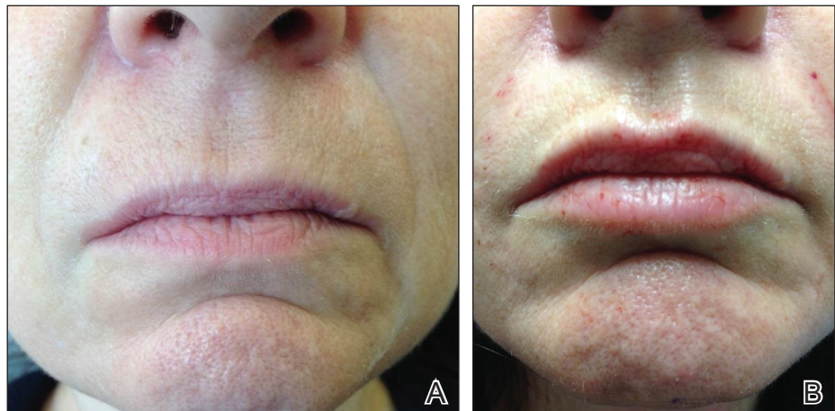
Figure 2. A 51-year-old woman who presented for lip augmentation before (A) and immediately after injection of 0.3 mL of a hyaluronic acid filler into the lip body and vermilion (B).

this area. 27 Similarly, the depressor anguli oris muscle is targeted by injection of 4 U bilaterally to soften the marionette lines. In the chin area, the mentalis muscle can be targeted by injection of 2 U deep into each belly of the muscle to reduce the mental crease and dimpling. 28 Combination treatment with dermal filler and neurotoxin demonstrates effects that last longer than either modality alone without additional adverse events. 29 With combination therapy, guidelines suggest treating with filler first. 27