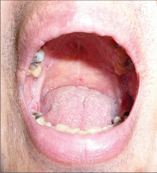
Figure 2. Minimal buccal and palatal erosion 1 month after initiation of oral prednisolone and oral azathioprine.

suppression of further eruption. At the patient's most recent follow-up (2.5 years after the initial presentation), he was in remission and was currently taking oral azathioprine 100 mg once daily and no oral corticosteroids.