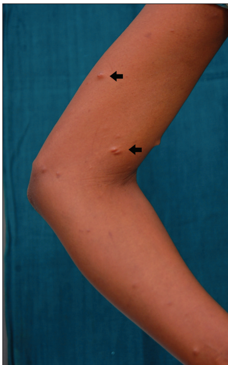
Figure 1. Cutaneous neurofibromas (molluscum fibrosa) (black arrows) on the left upper arm.