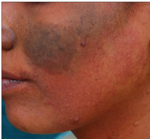
Figure 3. Evidence of twin spotting with pigmented nevus (nevus of Ota) along with adjoining vascular nevus (nevus flammeus, port-wine stain).

Health for diagnosis of NF-1. 4 On clinicopathological correlation we made a diagnosis of phacomatosis cesioflammea in association with NF-1. We have reassured the patient about the benign nature of vascular nevus. She was informed that the skin nodules could increase in size during pregnancy and