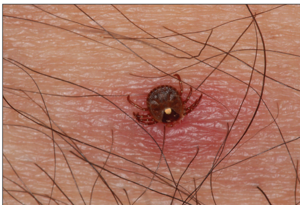
Figure 1. The female lone star tick demonstrates a single white spot on the scutum, leading to the common name lone star tick. A local inflammatory reaction has surrounded the site of attachment.