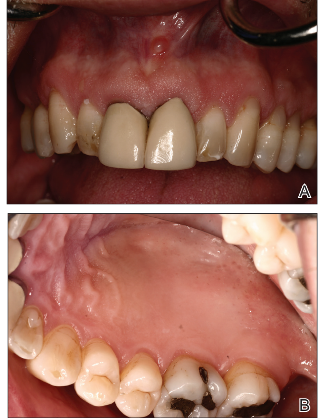
Figure 3. Dramatic reduction in mucosal erythema of the maxillary gingiva (A) and hard palate (B) was seen 2 months after adalimumab treatment was resumed.

lymphocytes. Specimens suspected for oral psoriasis should routinely be stained with periodic acid–Schiff to rule out candidiasis coinfection. The microscopic findings of our patient were congruent with prior reports of oral psoriasis.<sup>7,10-12</sup> Some clinicians have questioned if psoriasis can actually occur in the oral cavity, but most authorities in the field have recognized its true existence, as evidenced by various shared HLA antigens, specifically HLA-Cw.<sup>13</sup>