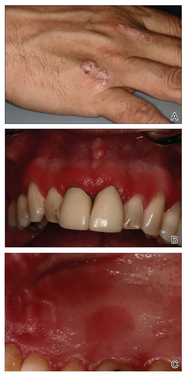
Figure 1. Pruritic, erythematous, white, thickened, scaly plaques on the right hand (A). Intensely inflamed and edematous maxillary gingiva (B). Erythematous macules on the hard palate (C).

At a 2-month follow-up, the biopsy site had healed without incident and without loss of the gingival architecture. There was an almost-complete resolution of the gingival erythema (Figure 3A) and the patient has since noticed a lack of bleeding using floss. Additionally, the red macules on the palate were no longer present (Figure 3B). The cutaneous