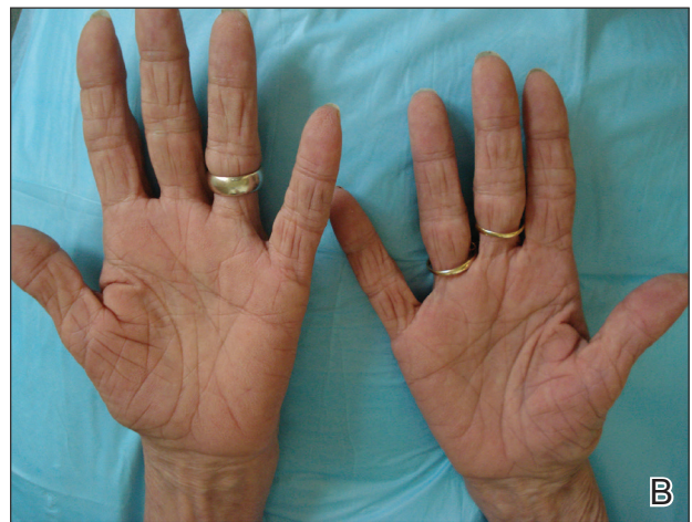
Figure 1. Palmoplantar keratoderma secondary to uterine adenocarcinoma with thickening of the palms prior to chemotherapy (A). The palmar thickening decreased after completion of treatment (B).