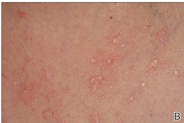
Figure 1. Epidermodysplasia verruciformis with pink scaly macules on the chest resembling pityriasis versicolor (A and B).