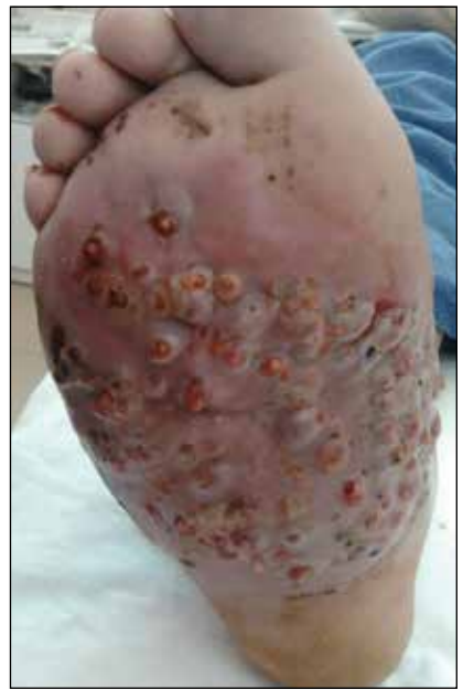
FIGURE 1. Local tumefaction, fistulated nodules, and abscesses discharging a serohemorrhagic fluid on the right foot of a patient with eumycetoma pedis.