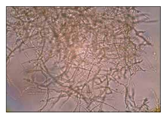
FIGURE 2. Septate branching hyphae were noted with potassium hydroxide solution 20%.

Radiography of the right foot showed osteolytic lesions on bones in the right foot (Figure 3B), and a repeat culture showed the presence of Staphylococcus aureus ; thus, treatment with itraconazole 200 mg once daily along with antibiotics (cefuroxime and gentamicin) was started immediately. Surgical treatment was recommended, but the patient refused treatment.