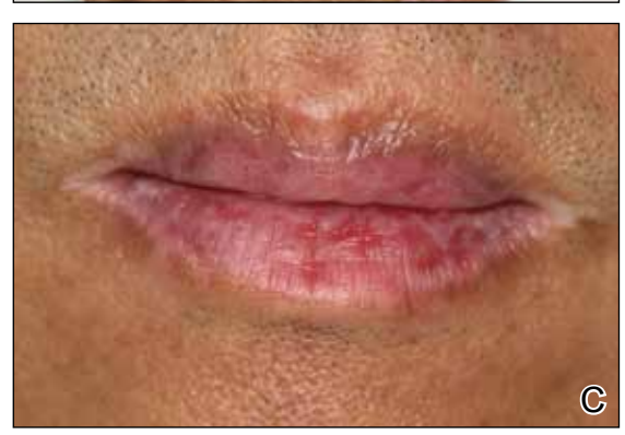
FIGURE 1. Multiple ill-defined, brown to violaceous, slightly scaly, flat-topped polygonal papules or plaques on the left lower leg (A) and right dorsal hand (B) as well as lacelike fine white lines on the lower lip (C).

chronic myelogenous leukemia and gastrointestinal tract stromal tumors. ^{9,10}