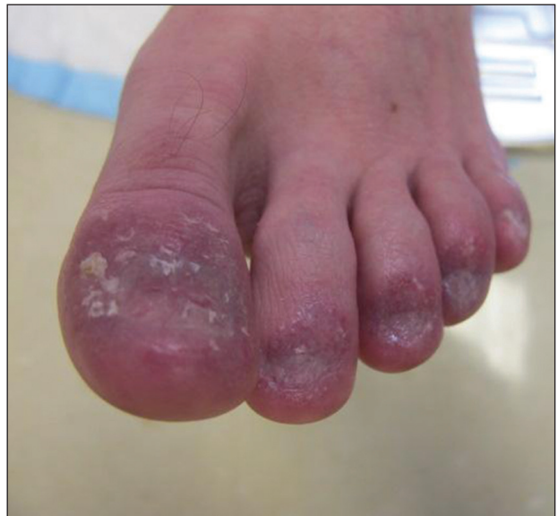
FIGURE 1. Left hallux with onycholysis, loss of the nail plate, and a yellow fibrinous base with concomitant erosion, erythema, and edema of the proximal toenail fold.

penicillin-sensitive Enterococcus faecalis . Magnetic resonance imaging was performed to evaluate for osteomyelitis because of lack of resolution. Results demonstrated osteomyelitis of the distal tuft of the left hallux and the distal phalanx of the second toe (Figure 2). Vascular surgery evaluation revealed no evidence of large vessel arterial insufficiency. She was started on amoxicillin for superficial Enterococcus and