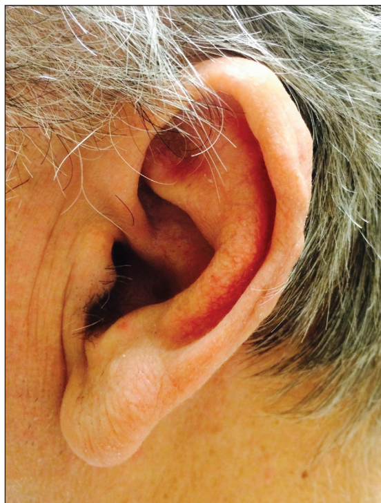
FIGURE 1. Normal-appearing skin on the left ear in a patient with auricular ossificans. Palpation of the auricle revealed a bonelike consistency.

Auricular ossificans, which is characterized by the replacement of external ear cartilage by bone, is a rare condition with as few as 22 histologically proven cases documented in the literature. 1,2 One case was