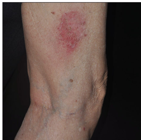
FIGURE 3. Sorafenib-induced pustular psoriasis. Erythematous scaly plaque with pustules along the periphery on the right lateral thigh (patient 2).

Patient 3 —A 45-year-old woman with history of acute myeloid leukemia (AML) was started on sorafenib 200 mg twice daily as part of a clinical pilot study to maintain remission following an allogeneic bone marrow transplant. Four months after beginning sorafenib, the patient developed multiple well-defined, erythematous, thin papules and plaques with overlying flaky white scale on the bilateral upper extremities and trunk and scattered on the bilateral upper thighs (Figure 4) along with abdominal pain. Her other medical history, physical findings, and laboratory results were unremarkable, and there was no personal or family history of psoriasis. Her oncologist suspected that the eruption and symptoms were due to sorafenib and reduced the dose to 200 mg daily. Histologic analysis of a punch biopsy specimen revealed subcorneal neutrophilic collections with mild spongiosis and mild perivascular inflammatory infiltrate composed of lymphocytes and neutrophils (Figure 5). Direct immunofluorescence was