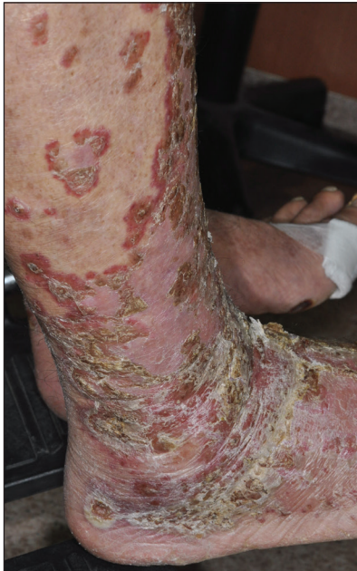
FIGURE 1. Sorafenib-induced plaque-type psoriasis. Erythematous thin papules and plaques with adherent white scale and yellow crust on the right lower leg (patient 1).

Patient 2 —An 82-year-old man with chronic hepatitis B infection and HCC with lung metastasis was treated with sorafenib 400 mg daily. One week after treatment,