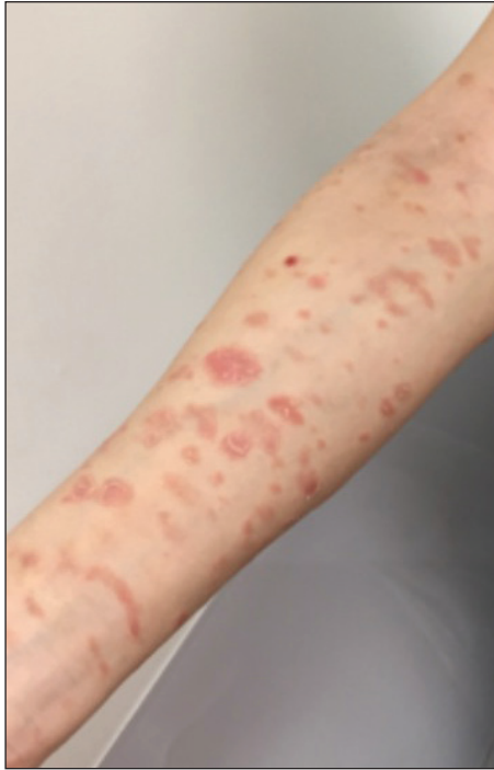
FIGURE 4. Sorafenib-induced psoriasiform drug eruption. Numerous erythematous scaly papules and plaques on the right ventral forearm (patient 3).