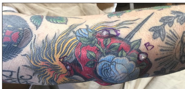
FIGURE 1. Three hyperkeratotic papulonodules within the red portions of a multicolored tattoo on the right forearm and elbow.

Tattooing is a popular practice dating back to 3000 BC. 6 It is estimated that 24% of the US adult population has a tattoo 7 and as many as 20% of individuals with tattoos (approximately 50 million individuals) have experienced an adverse cutaneous reaction after the introduction of exogenous pigments into the skin. 8 Cutaneous tattoo