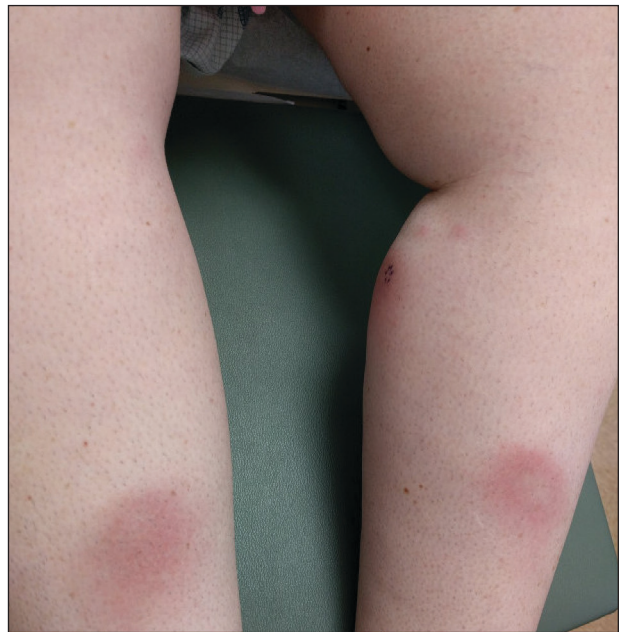
FIGURE 1. Pink-red subcutaneous nodules with central pallor ranging in size from 4.5 to 7 cm on the lower extremities.

Laboratory testing was negative for infectious processes including Lyme disease, tuberculosis, and Streptococcus due to recent upper respiratory infection. Punch biopsy of a left shin lesion revealed a lobular panniculitis with lymphohistiocytic inflammation, a focal lymphocytic vasculitis, and small granulomas (Figure 2). Periodic acid-Schiff, Gram, and acid-fast bacilli stains were negative. After ruling out alternative causes, the etiology of the panniculitis was deemed to be a pembrolizumab side effect.