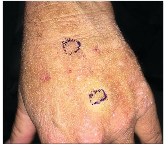
FIGURE 2. Few hemorrhagic papules from mechanical trauma within a large collection of flesh-colored to translucent, dome-shaped papules on the left hand.

apple-green birefringent on Congo red stain and are periodic acid–Schiff and thioflavin T positive. Laminin and type IV collagen stains are negative with adult colloid milium but are positive with amyloidosis and lipoid proteinosis. 3 Electron microscopy also may help distinguish between amyloidosis and adult colloid milium, as these conditions may have a similar histologic appearance.