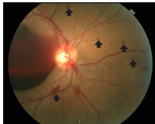
Figure 2. Multiple white-centered intraretinal hemorrhages, or Roth spots (arrows) were noted in the right eye.