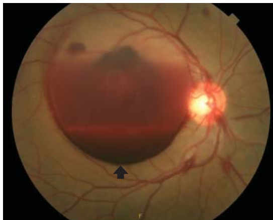
Figure 1. A dilated fundus photograph of the patient's right eye shows large subhyaloid hemorrhage (arrow).