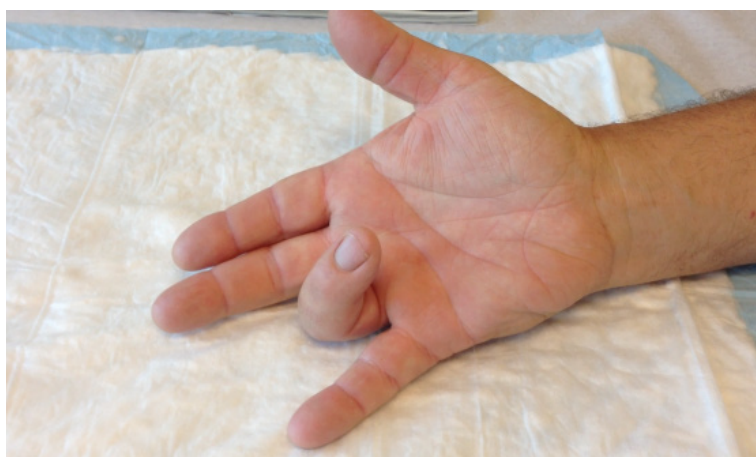
Figure 1. Trigger digit locked in flexion.

reported. 8 Overall, the procedure is very successful, providing up to 100% symptom relief. 7,8,10