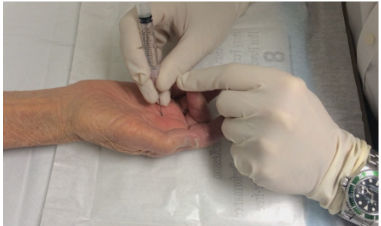
Figure 2. Percutaneous release of trigger digit with an 18-gauge needle.

There were no complications: infection; nerve, artery, or tendon injury; or chronic pain. Some patients had mild stiffness, swelling, or pain for a few days after the procedure, and these effects