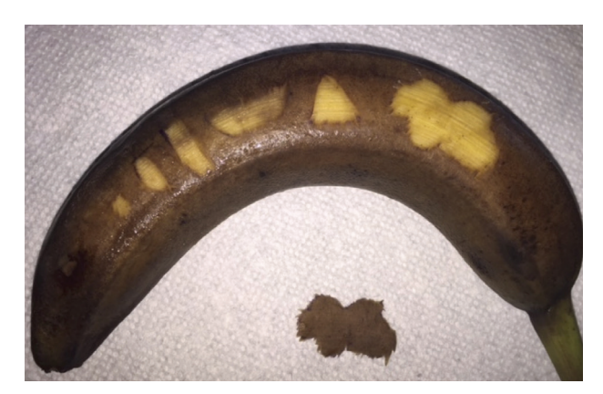
FIGURE 2. Defects with smooth bevel and floor after shave removal using the banana practice model.

tearing of the tissue being removed, the angle of the blade relative to the tissue must be assessed at all points, and the alteration in color and fiber orientation signify change in depth of the banana peel.