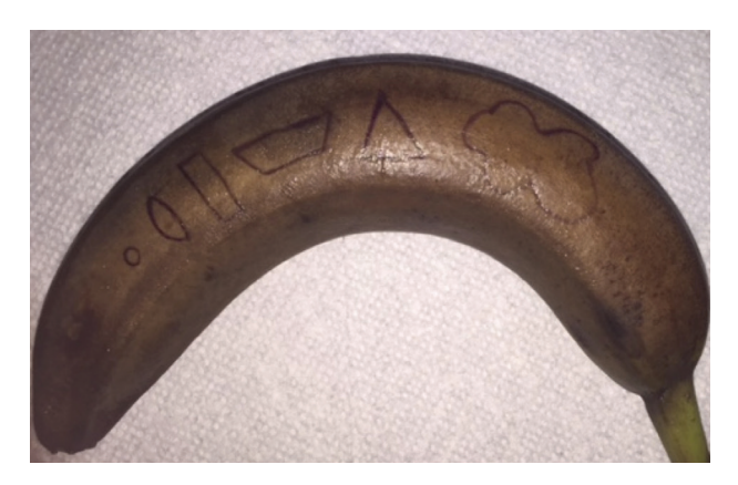
FIGURE 1. Banana with marked lesions. From left to right: circle, ellipse, rectangle, trapezoid, triangle, and multilobed lesion.

To begin, one simply requires a marking pen, banana, and razor blade. Various shapes, including a circle, ellipse, rectangle, trapezoid, triangle, and multilobed lesion are demarcated by students or attendings (Figure 1). Careful removal of the pieces helps students improve dexterity, develop feel for the entire edge of the razor blade, and acquire muscle memory for these skilled movements (Figure 2). Three-dimensional spatial reasoning is honed with practice using the FSB to control appropriate thickness and defect depth while creating a smooth bevel around the entire perimeter, which is important for optimal cosmesis in second intention healing or grafting. The shallower the defect created, the faster the healing and the greater the reduction in contracture. Although downward pressure is important to prevent buttonholing or