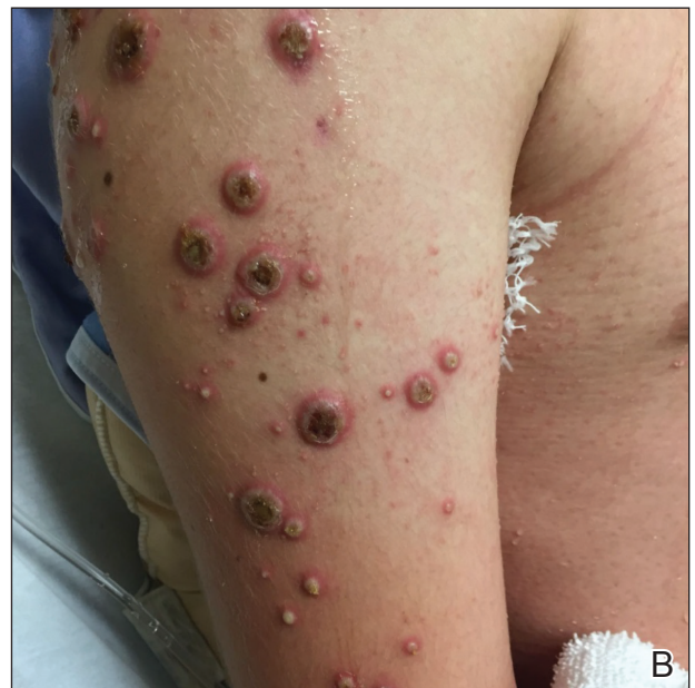
FIGURE 2. Clinical presentation at the time of admission to the hospital. Diffuse, well-demarcated, discrete and confluent ulcers with violaceous overhanging borders were mostly consistent with pyoderma gangrenosum (A). Well-demarcated, discrete, annular, edematous, pseudovesicular papules with hemorrhagic crust in the center which were consistent with Sweet syndrome (B).