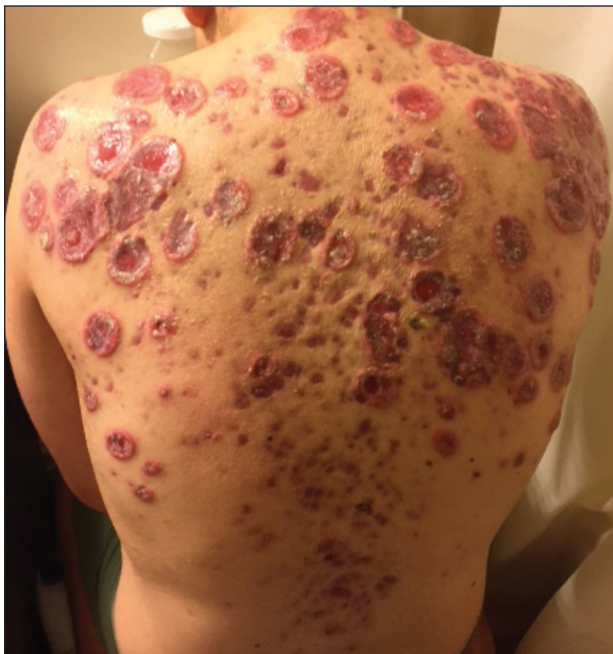
FIGURE 1. Initial presentation of lesions in an adolescent boy with acne conglobata after a short course of doxycycline followed by a very short course of isotretinoin.

leukocytosis ( 14 \times 10^9/\text{L} [reference range, 4.5\text{--}11.0 \times 10^9/\text{L} ]), and transaminitis (alanine aminotransferase, 72 U/L [reference range, 10\text{--}40 U/L]). A radiograph of the clavicle did not reveal any osteitis. Rheumatology assessment ruled out the presence of any synovitis. Based on the patient's history and physical presentation, a differential diagnosis of acne fulminans, pyoderma gangrenosum, and Sweet syndrome was entertained. Histologic findings were consistent with a diagnosis of ulcerative neutrophilic dermatosis. The patient required prolonged hospitalization ( >3 months) for treatment, dressing changes, and pain control.