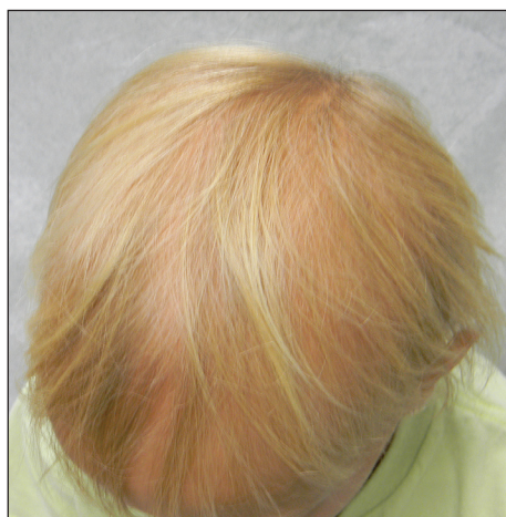
FIGURE 1. Hereditary hypotrichosis simplex of the scalp characterized by short blonde hair with diffuse thinning of the crown.

Hereditary hypotrichosis simplex (HHS) (Online Mendelian Inheritance in Man [OMIM] 146520) is a rare form of hypotrichosis that typically presents in school-aged children as worsening hair loss localized to the scalp. 1 Most patients are unaffected at birth and otherwise healthy without abnormalities of the nails, teeth, or perspiration. Examination of the scalp reveals normal follicular ostia and absence of scale and erythema; however, decreased follicular density may be noted. 1 The histopathologic findings of HHS reveal velluslike hair follicles without associated fibrosis or inflammation. 2 Examination of hair follicles with light microscopy is unremarkable. 3,4 Historically, this condition has been largely regarded as autosomal dominant, with variable severity also described within families. Herein, we report a case of this rare disease in a child, with 2 family members displaying a less severe phenotype.