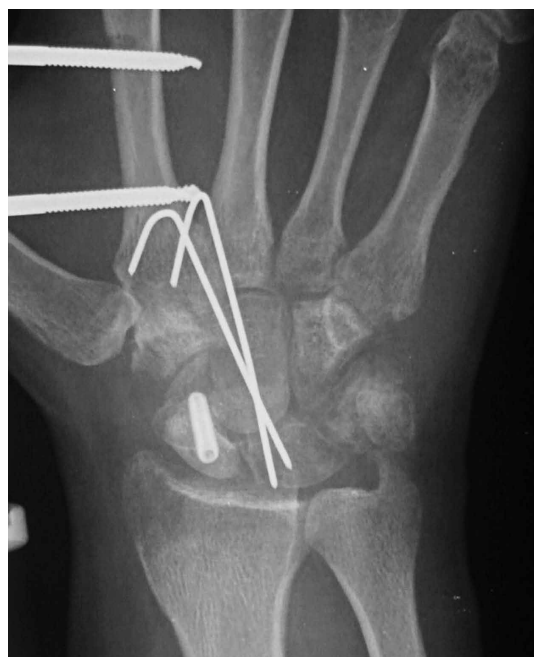
Figure 4. Anteroposterior radiograph of the right wrist at 6-week follow-up.

Abbreviations: C, capitate, proximal fragment; R-P, radial and proximal side of the dorsum of wrist.