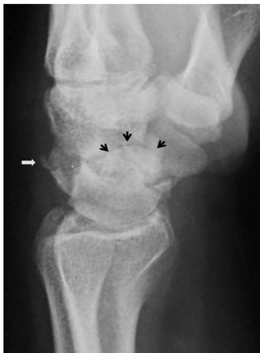
Figure 2. Lateral radiograph of the right wrist shows the domed articular surface of the proximal capitate fragment (black arrows) and an avulsion flake fracture of the dorsal surface of the triquetrum (white arrow). The capitate fragment is rotated 180° facing distally and is displaced palmarly between the lunate and the distal capitate fragment.