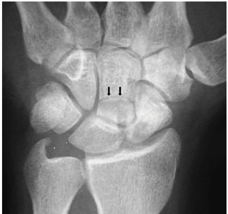
Figure 1. Anteroposterior radiograph of the right wrist shows a fracture of the capitate with the fracture line (black arrows) extending proximally to the waist of the capitate.

Skin sutures were removed 2 weeks after surgery, K-wires 6 weeks after surgery, and the external fixator 8 weeks after surgery. At 8 weeks, radiographs showed healing of both fractures, scaphoid and capitate. The patient was allowed gradual passive and active-assisted range-of-motion exercises of the wrist at 8 weeks, and he returned to work 3 months after surgery. At