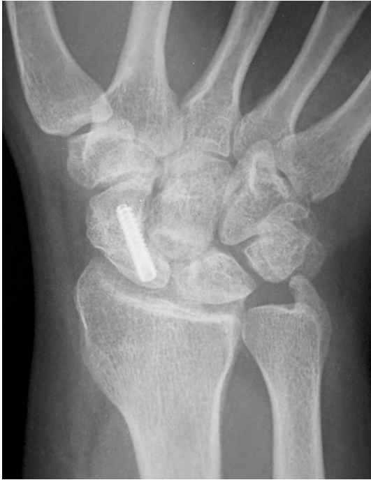
Figure 5. Anteroposterior radiograph of the right wrist at 24-month follow-up.

in relation to the lunate. The lateral radiograph of the wrist showed its position in the lunate fossa. According to the classification of Herzberg and colleagues 12 and Mayfield and colleagues, 13 this represents a dorsal PLFD of the greater carpal bones arc.