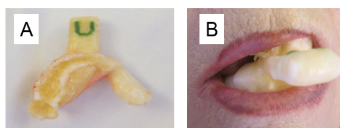
FIGURE 2 A tissue positioner designed for a patient being treated to the left parotid tumor bed. A , The tissue positioner as it was presented to the patient, with the U (Up) when it was introduced into the mouth. When in place, the positioner pushed the tongue to the right side of the mouth, out of the beam of radiation, to decrease the possible radiation toxicity to the tongue, namely loss of taste and mucositis. B , The positioner in place, before application of the face mask.

Check for dental cysts Check for periodontal disease Check for gross tooth decay (caries) Dental abscesses External or internal root resorption Ectopic eruption