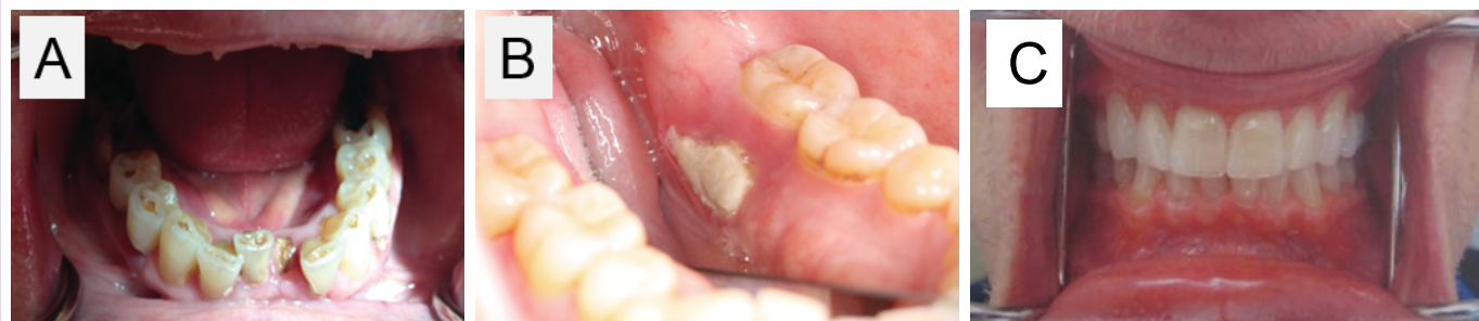
FIGURE 4 Dental caries (A) and osteoradionecrosis (B) occurring after cessation of radiation, and C, perfect dentition in a patient 4 years after radiation for stage IVA tonsil cancer.

by promoting angiogenesis and osteogenesis. HBO must be used as an adjunct to debridement with primary non-tension tissue closure and followed with antibiotics for 10 days. 13,14 Such therapy usually consists of 20 treatments, followed by surgery, then another 10 treatments. 15 When patients are properly screened, hyperbaric oxygen treatment has been found to be safe for these individuals with irradiated tissues. 16