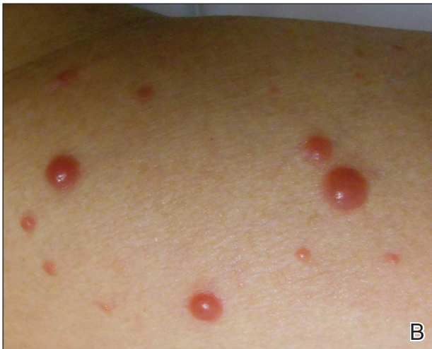
FIGURE 1. Numerous erythematous and violaceous papules and nodules on the right side of the neck (A) and left arm (B) in a patient with adult T-cell leukemia/lymphoma.