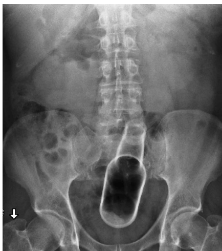
Figure 1. Abdominal radiograph showing a foreign body consistent with a beer bottle in the pelvic region.

series was obtained and confirmed a beer bottle in the rectum ( Figures 1 and 2 ). This study was performed prior to the rectal examination to evaluate the orientation and integrity of the item, to prevent accidental injury from sharp objects. On examination, there was palpable glass in the rectum consistent with the rounded base of a bottle. The glass appeared intact and no gross bleeding was noted. Given the orientation of the bottle on the X-ray image, a surgical consultation was obtained and the patient