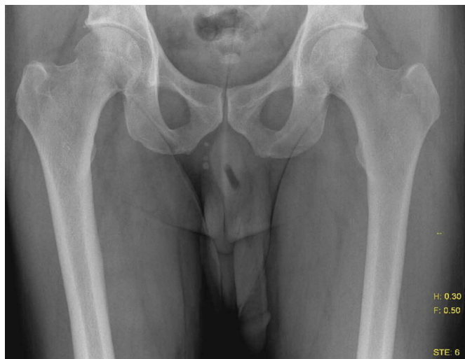
Figure 3. Pelvic radiograph showing a 3.5-cm long radiolucent structure projecting over the midline penis. A pen cap was eventually retrieved.