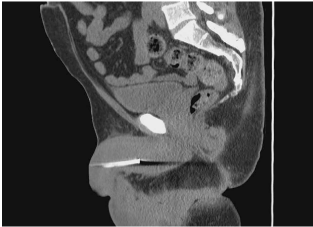
Figure 5. Computed tomography scan of the abdomen and pelvis sagittal view showing a 4.9-cm x 4.5-mm radiopaque foreign body in the penile urethra that was eventually found to be a screw.