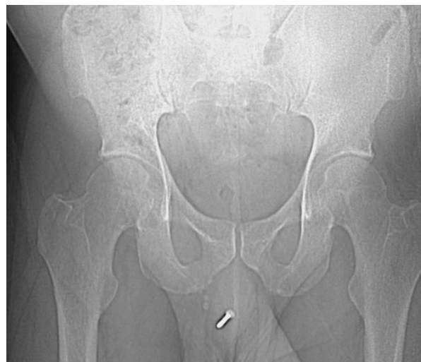
Figure 4. Abdominal radiograph showing a radiopaque foreign body consistent with a screw in the penile urethra.

was taken to the operating room (OR). The foreign body was successfully removed with manual extraction under general anesthesia. The patient did not experience any complications. He was offered psychiatric counseling in the ED, but he declined. He was discharged home with a referral to a psychiatrist for counseling.