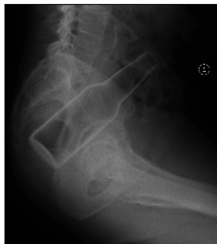
Figure 2. Abdominal radiograph lateral view showing a foreign body consistent with a beer bottle in the rectum.