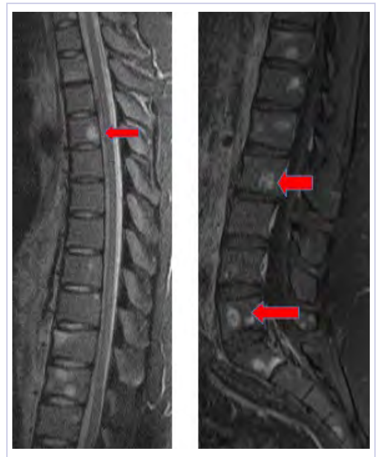
FIGURE 3 Osteolytic vertebral lesions (sagittal view). Red arrows show the osteolytic lesions in the L2 (left) and in L2 and L5 (right) vertebrae.

Kaposi sarcoma musculoskeletal involvement, specifically bone, is atypical. If it does occur, it usually manifests as a result of contiguous invasion from an adjacent nonos-