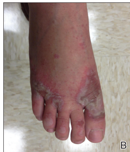
FIGURE 2. Large flaccid bullae on the bilateral heels (A) and dorsum of the right foot (B).