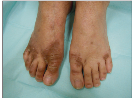
FIGURE 4. Bullae and hyperpigmented macules and patches with scale resolved on the dorsum of the feet.

Diagnosis —Evaluation includes measurement of plasma zinc levels. Zinc levels less than 50 \mu\text{g/dL} are suggestive but not diagnostic of AE. 5 Although plasma zinc measurement is the most useful indicator of zinc status, its utility in assessing the true total body store of zinc is limited. Plasma zinc is tightly regulated and only represents 0.1% of body stores. 5,6 Additionally, zinc levels may decrease in proinflammatory states. 12 Beyond zinc measurement, evaluation of alkaline phosphatase, a zinc-dependent enzyme, can provide useful diagnostic information. 5,6