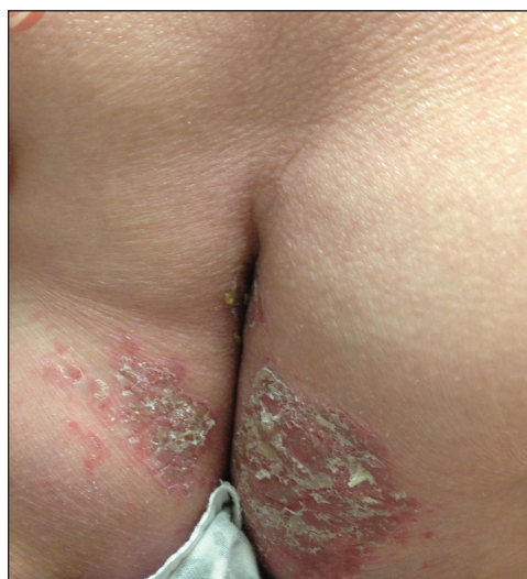
FIGURE 1. Sharply demarcated, erythematous, scaly plaques on the bilateral gluteal folds.

Physical examination revealed sharply demarcated, erythematous, scaly plaques perinasally, periorally, and on the bilateral gluteal folds (Figure 1). There were sharply demarcated, erythematous, scaly plaques on the