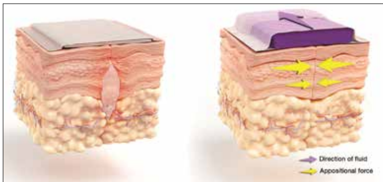
Passive wound closure (left) compared with negative-pressure wound therapy with the Prevena incision management system (right).

The primary outcome of interest was the frequency of SSI. Secondary outcomes included dehiscence, seroma, endometritis, a composite measure for all wound complications, and hospital readmission.