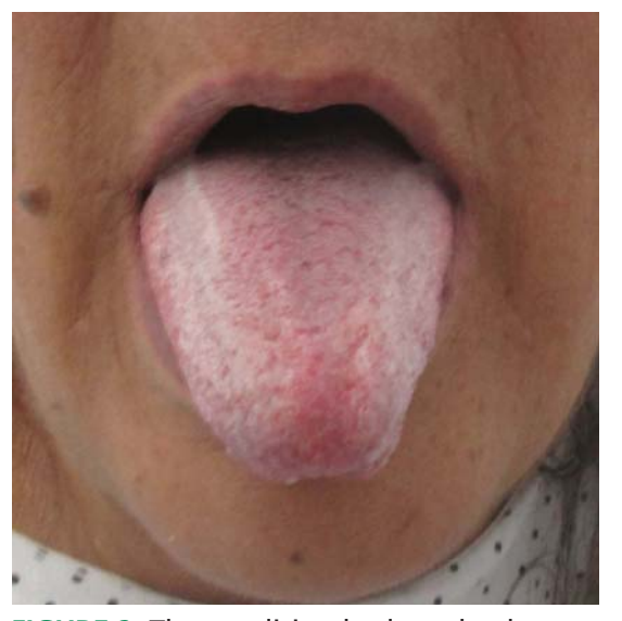
FIGURE 2. The condition had resolved 1 week later.

note, during her 1-week hospital stay, she was treated with levofloxacin for the respiratory infection, and she did not smoke during this period. One week after her admission, the lesions had disappeared ( Figure 2 ).