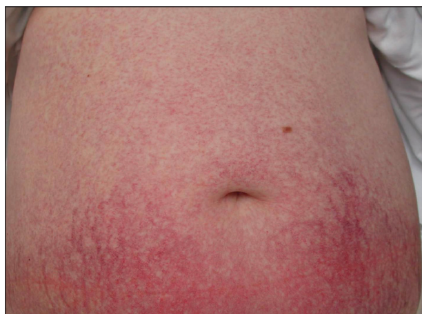
FIGURE 3. Sheets of telangiectasias scattered on the abdomen in patient with cutaneous collagenous vasculopathy, where they became less confluent with proximal spreading.