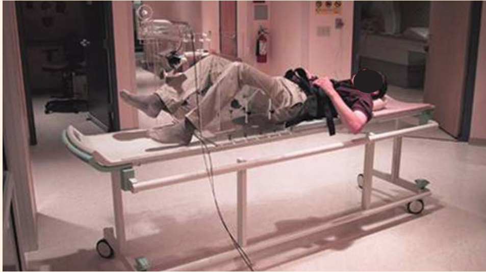
FIGURE 2. Brain activation before and after treadmill training is sampled in a stroke survivor using functional magnetic resonance imaging during unilateral knee movements. A plexiglass scaffold has been custom-designed to define range of motion and minimize concomitant head motion.

ters of ambulation. Whether the cortical areas influence ambulatory recovery mediated by exercise training or whether the recruitment of spinal gait areas is needed to improve motor control after stroke is not known in humans. We will test the hypothesis that the recruitment of cortical and/or subcortical areas is relevant to some or all of the exercise-induced neuroplasticity response to treadmill rehabilitation. If a consistent pattern of brain regional activation is associated with an improvement in walking ability, this finding will suggest potential brain targets for neurally directed rehabilitation interventions. If brain targets for rehabilitation produce viable therapeutic improvement in walking and cardiocirculatory performance (such as VO_2 ), this will be further evidence of heart-brain interactions.