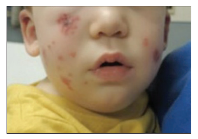
FIGURE 2. Purpuric papules and plaques on the face.

Histopathologic analyses with hematoxylin and eosin staining (Figure 3) and DIF (Figure 4) were performed from within a representative purpuric plaque on the right hip. Direct immunofluorescence was performed to evaluate for an IgA vasculitis versus an alternative type of vasculitis. The hematoxylin and eosin—stained specimen demonstrated a dermal perivascular infiltrate involving superficial and deep vessels with neutrophils, karyorrhexis, and erythrocyte extravasation. The endothelium was intact, with a mild suggestion of fibrinoid change of the blood vessel walls. Direct immunofluorescence revealed granular deposition of IgA, C3, and fibrinogen in multiple dermal blood vessels. Combined, the specimens were interpreted as evolving IgA-associated leukocytoclastic vasculitis.