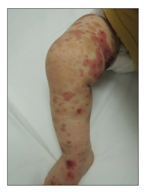
FIGURE 1. Edematous, palpable, purpuric coalescing papules on the right leg.