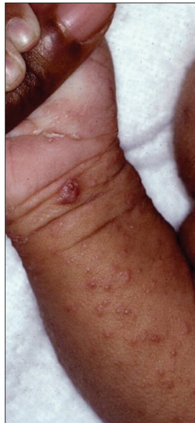
FIGURE 2. Scabies rash in an infant with burrows and erythematous papules.

access to health care. 22 In Brazil, scabies is hyperendemic in many poor communities and slums and is commonly associated with considerable morbidity. 23 Edison et al 24 reported that scabies and bacterial superinfections cause substantial morbidity among American Samoan children, with superinfections present in 53% (604/1139) of children diagnosed with scabies. Steer et al 25 found that impetigo and scabies had been underestimated in Fiji where 25.6% and 18.5% of primary school children and 12.2% and 14.0% of infants had impetigo and scabies, respectively. In a systematic review of scabies and impetigo prevalence, Romani et al 26 concluded that scabies and associated impetigo are common problems in the developing world that disproportionately affect children and communities in underprivileged areas and tropical countries, with the Pacific and Latin American regions having the highest prevalence of scabies. Scabies represents a major health concern worldwide due to the strong relationship between scabies and secondary infection. 27