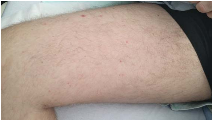
FIGURE 1. At presentation, the patient had a sparse, erythematous, macular, nonblanching rash on the lower and upper limbs.

The patient had been taking a TNF-alpha inhibitor and had recently returned from Mexico