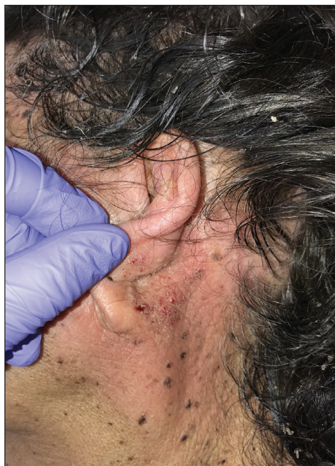
FIGURE 2. Resolution of the plaques after scrubbing with isopropyl alcohol 70%.

process. 3 Failure to consider TFFD as a diagnosis has led to unnecessary endocrine workups and invasive biopsies. 4 Therefore, physicians should have early clinical suspicion of TFFD and be aware of the bedside diagnostic procedure using isopropyl alcohol.