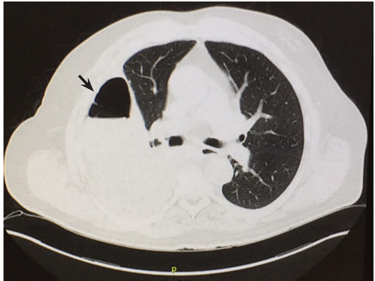
Figure 1. Computed tomography shows a wedge-shaped area of low attenuation suggesting a focal infarction in the collapsed and consolidated right lower lobe.

Blood in the pleural fluid does not necessitate withholding anticoagulation unless the bleeding is heavy. A pleural fluid hematocrit greater than 50% of the peripheral blood hematocrit suggests hemothorax and is an indication to withhold anticoagulation. 1 Our patient's pleural fluid was qualitatively san-