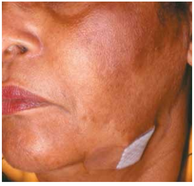
Figure 3. Mandibular melasma.

Hassan et al<sup>9</sup> evaluated 36 women with melasma and found elevated levels of LH, follicular stimulating hormone, and estradiol, and low levels of prolactin compared with control subjects. Twenty-six of the study participants (72%) did not report any relationship between prior pregnancies and melasma. The investigators proposed that increased estrogen levels may help maintain melasma.