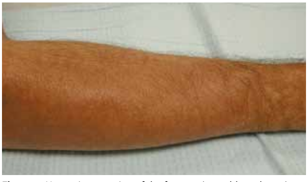
Figure 4. Hyperpigmentation of the forearm (arguably melasma).

Fitzpatrick skin types IV and V) developed postinflammatory hyperpigmentation that necessitated the use of topical bleaching agents.