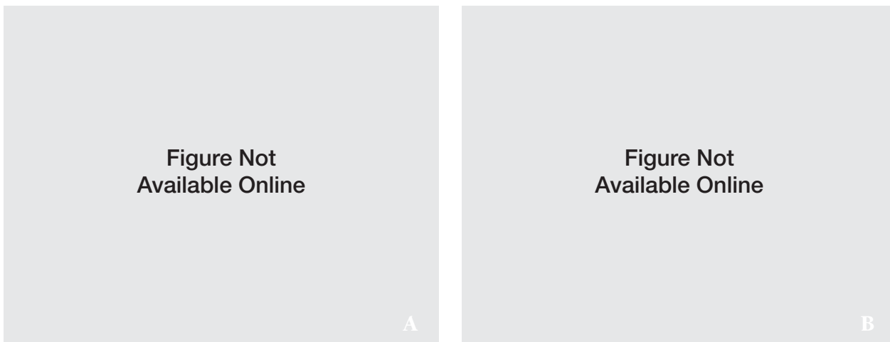
Figure 1. Patient with severe melasma at baseline (A) and at week 12 posttreatment with a triple-combination cream containing tretinoin 0.05%, hydroquinone 4%, and fluocinolone acetonide 0.01% (B). The telangiectasias present at baseline remained after treatment was completed.

effect. In the later clinical trials, the efficacy and tolerability of each possible combination of 2 of the 3 ingredients were compared with those of the triple-combination formulation, with the same resulting loss of efficacy. The 3 components, therefore, appear to have additive, or even synergistic, effects.