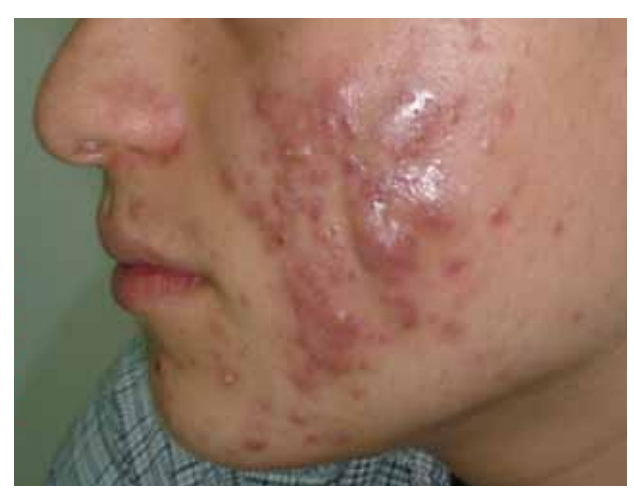
Figure 3. These are nodules—not cysts—in a severe form of inflammatory acne vulgaris.

In short, it is a nodule, not a cyst, that we observe in most cases of inflammatory acne vulgaris.