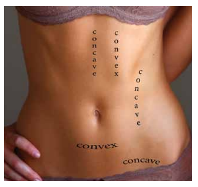
Figure 1. Surface contours of the youthful, fit, nulligravida abdomen.

rectus abdominis plication from xiphoid to pubic symphysis with a combination of running and interrupted sutures. Care is taken to avoid strangulation of umbilical blood supply. Plication medializes the epigastric skin attachments to deep fascia, which can then be mobilized sufficiently to create paramedian fullness by slight bunching of epigastric skin and fat. The distal end of the flap is pulled caudally, and skin redundancy is marked for