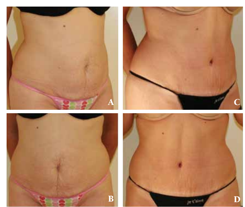
Figure 2. Oblique view and front view of a female patient after 3 pregnancies before (A,B) and 2 months after modified abdominoplasty (C,D).

Liposuction, even in combination with topically or subdermally applied energy to induce collagen contraction, is of limited utility for treatment of postpartum abdominal wall relaxation and redundant skin. Pregnancy