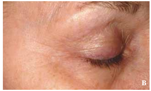
Figure 3. Female patient with fine wrinkling before (A) and 4 weeks posttreatment with Pyratine-6 (B).