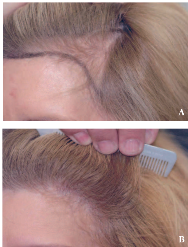
Figure 3. Patient before first transplant. The black crayon outlines the proposed recipient area for session (A). Eleven months after a session of 1973 follicular transplant units (B).

Scalp flap surgeries, most notably the Juri flap and the Fleming-Mayer flap, have been described but are no longer as popular as they were in the 1980s. 69 The pedicle of these flaps, both of which are temporoparietal flaps, arise from the posterior branch of the temporal artery. The flaps can be as long as 24 cm and are sufficient for creating an entire frontal hairline 3- to 4-cm