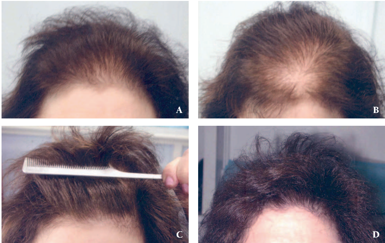
Figure 2. Before treatment with hair combed back for clinical evaluation (A), caudal view (B). Twelve months after frontal hair transplant with 934 follicular units (C) and 3½ years after second follicular unit transplantation session (D).

follicular unit extraction permits the removal of less tissue with an optical cosmetic outcome. The technique is particularly suited for hair restoration patients who want to maintain a short, or “buzzed,” hairstyle after surgery without a visible scar. The disadvantages include fewer grafts being transplanted per procedure, an increase in overall operative time and cost because of longer harvesting times, as well as an increased risk of transecting harvested hair follicles. 51