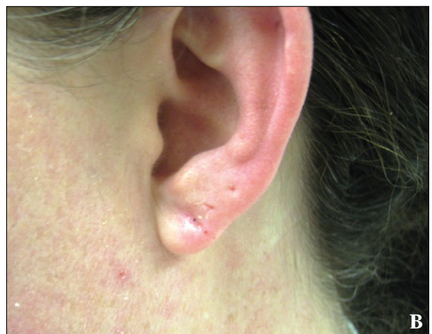
Figure 2. Ear lobe volume loss and crease before (A) and after hyaluronic acid filler injection (B).