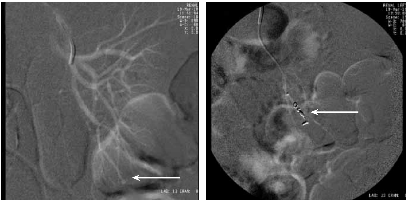
Figure 2. (Left) Selective left renal artery angiography. The white arrow indicates the aneurysm of the distal inferior polar left renal artery. This aneurysm developed as a consequence of the renal biopsy resulting in hemorrhage within the renal capsule. (Right) Selective left renal artery angiography. The white arrow indicates the coil after deployment resulting in embolization of the distal arterial segment and aneurysm.

cause compression. Compression of the parenchyma may lead to high BP and renal injury. Subcapsular hematoma most commonly occurs after renal biopsy or extracorporeal shock wave lithotripsy. 2 Subcapsular bleeding also occurs secondary to trauma or surgery. Spontaneous bleeding has also been reported in patients on warfarin therapy, renal tumors, or from polyarteritis nodosa. 5 Increased mass effect on the renal parenchyma has also resulted from lymphoceles, cysts, urinomas, and retroperitoneal paragangliomas.