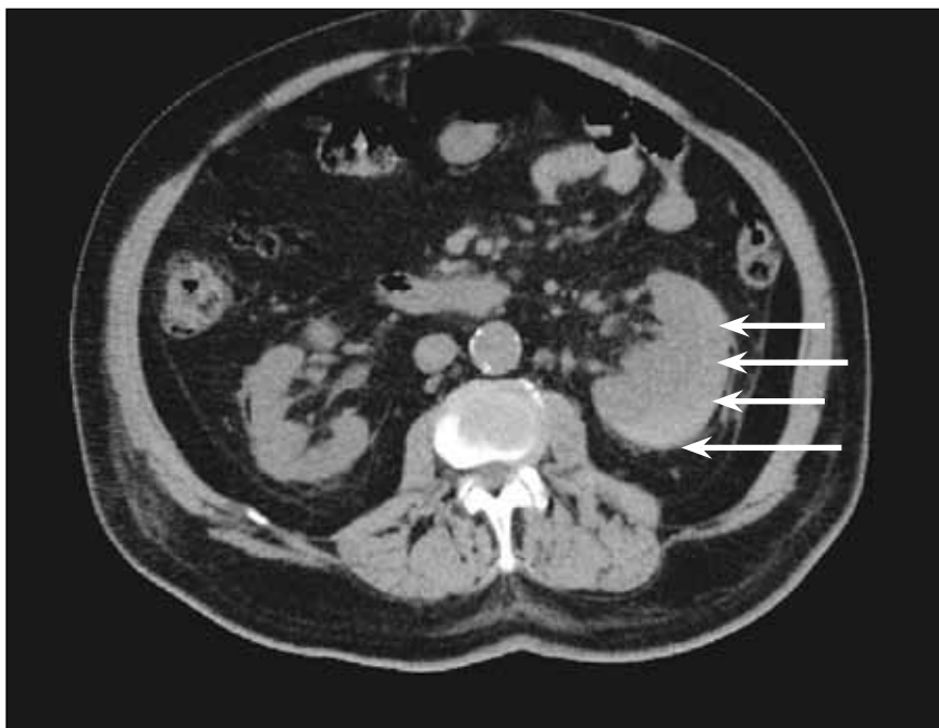
Figure 1. Noncontrast computed tomography slice of the abdomen. The white arrows indicate the area of the subcapsular hematoma as a high-attenuation mass.

the biopsy site, which represented an intrarenal hematoma along with the hemostatic agent. There was no visual evidence of a perinephric hematoma. The patient was then admitted to the hospital for a 23-hour observation period. Immediately following the procedure, he was placed in the supine position with strict bed rest for 6 hours. Vital signs were monitored every 30 minutes for the first 4 hours and, if stable, then every 4 hours. Complete blood cell counts (CBCs) were ordered for 6 hours and 20 hours after the procedure.