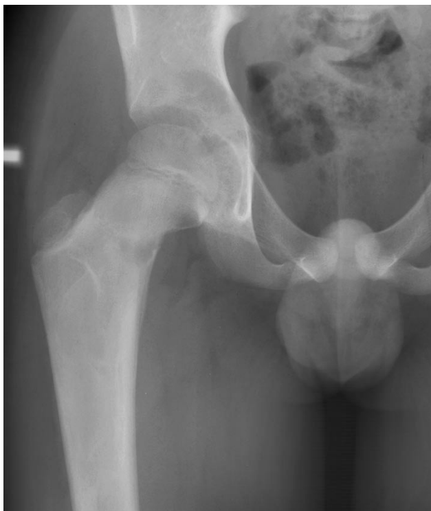
Figure 1. A 9-year-old boy with persistent hip pain was diagnosed with fibrous dysplasia.

In the present, retrospective review, we evaluate a relatively large case series of pediatric pathologic femoral neck fractures treated at an academic, tertiary-care referral cen-