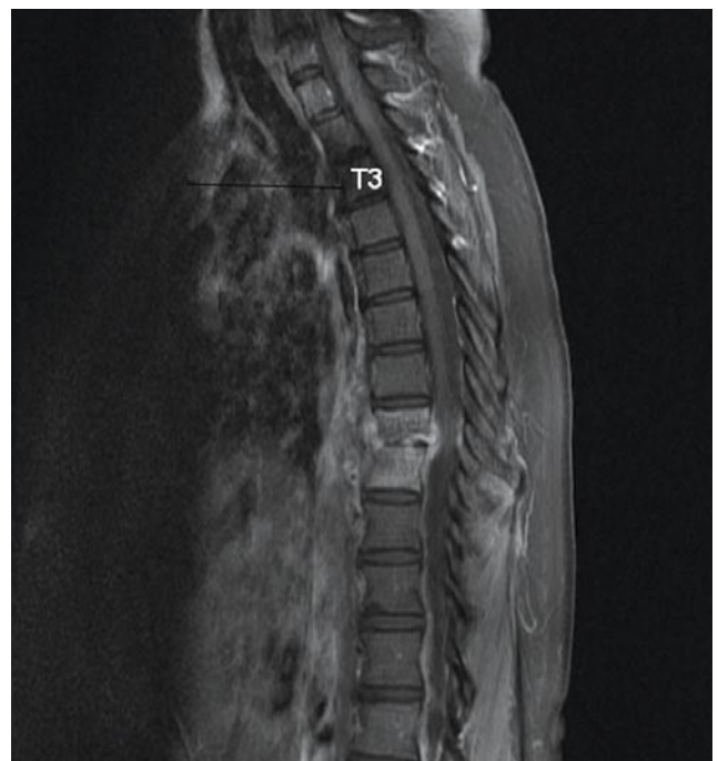
Figure 2. Midsagittal T 1 -weighted magnetic resonance imaging scan of same patient (Figure 1) shows tangential line to suprasternal notch intersecting T3 body.