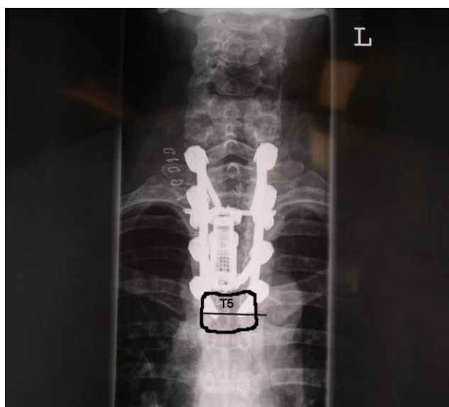
Figure 3. Postoperative radiograph shows use of Synex (Synthes Spine, Welwyn Garden City, United Kingdom) and cervical spine locking plate for fractured T3 vertebral body and low anterior cervical approach where line intersects T5 vertebral body. Posterior pedicle screw instrumentation was used to supplement anterior fixation. Reproduced with permission from: Lakshmanan P, Ahmed S, Al-Maiyah M, Lyons K, Davies PR, Howes J, Ahuja S. The low anterior cervical approach to the upper thoracic vertebrae: a decision by preoperative MR imaging. Diagn Interv Radiol. 2007;13(1):30-32.

pathologies related to the upper thoracic spine have been diagnosed, confirmed, and surgically addressed. Technically, exposing the upper thoracic spine is always a challenge.