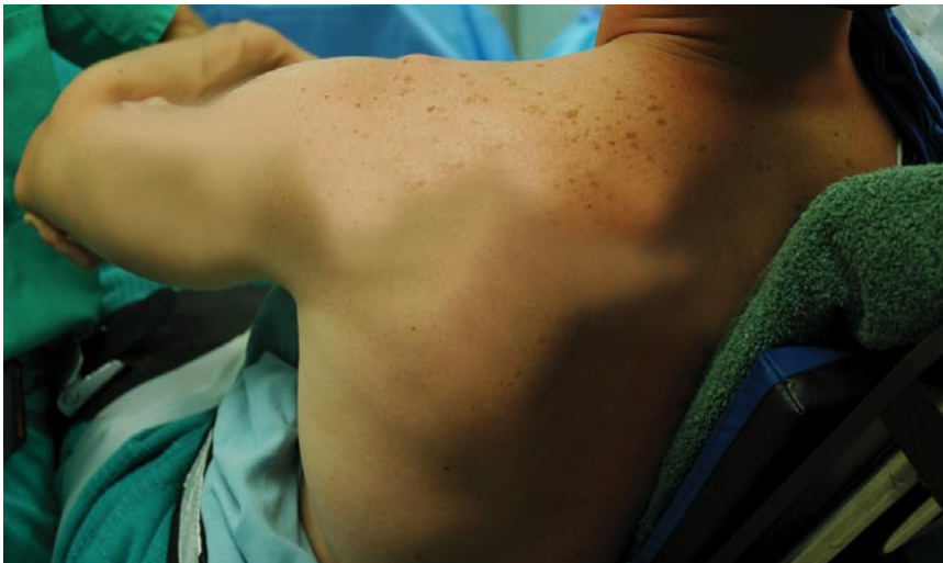
Figure 2. Spider positioning device (Tenet Medical Engineering, Calgary, Canada) was used to assist in protracting the scapula.

Canada) was used to assist with protraction of the scapula (Figure 2). (An assistant can also perform this function.) After glenohumeral and subacromial arthroscopy, as indicated, a 5-cm oblique incision was made over the superomedial border of the scapula from the superolateral to the inferomedial aspect and ending at the medial border of the scapula spine (Figure 3). Dissection was performed down to the bony scapular spine. The superomedial border of the scapula was dissected subperiosteally using blunt Cobb elevators to lift the supraspinatus muscle belly off the fossa. An electrocautery device was used to subperiosteally dissect the levator scapula and rhomboid minor off the superior and medial borders, respectively. In this way, the anterior and posterior superior medial muscles were maintained to their periosteal attachments. A microsagittal saw was used to make an oblique resection of bone at a 45° angle from the junction of the spine and medial border of the scapula, and care was taken to stay a finger breadth medial to the suprascapular notch (Figure 4). After meticulous hemostasis was maintained and irrigation performed, a running absorbable suture was used to close the fascia of the supraspinatus to the fascia of the infraspinatus over the scapular spine. The wound was then closed in the standard fashion.