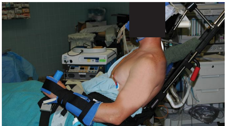
Figure 1. Each patient was placed in the standard beach-chair position.

Am J Orthop. 2009;38(5):249-251. Copyright 2009, Quadrant HealthCom Inc. All rights reserved.