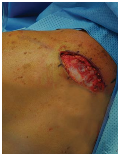
Figure 3. Oblique incision from superolateral to inferomedial aspect over superomedial border of scapula and ending at medial border of scapula spine.

After surgery, patients were placed in a shoulder immobilizer in slight abduction and neutral rotation to prevent periscapular muscle contraction. They were maintained in this brace, with removal for Codman exercises several times a day, for 2 weeks. Then passive and active assisted range of motion was initiated. Gentle strengthening was started at week 8 and continued until 12 weeks after surgery, when resistive exercises began. Patients usually return to sports 4 to 6 months after surgery, when proper thoracic posture, scapular control, and strength are obtained. 12