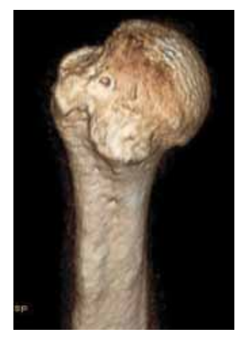
Figure 2. Computed tomography scan, showing osteolytic reaction after revision surgery.

Degradation products of the bioabsorbable polymer have been implicated in foreign-body reactions causing synovitis and osteolysis.<sup>3,4</sup> The polymer first is hydrolyzed at the amorphous phase of the implant. This causes loss of structural integrity and fragmentation, which initiates the biological response of clearing polymeric debris. With PLLA, this process may take up to several years.<sup>11,12</sup> Although there has been no specific identification of the critical factors leading to an osteolytic reaction, an immunologic basis has been proposed.<sup>13</sup> Another hypothesis is that there is a critical clearing capacity of the polymeric debris by the host phagocytic response that triggers lysis.<sup>7,14</sup> In materials