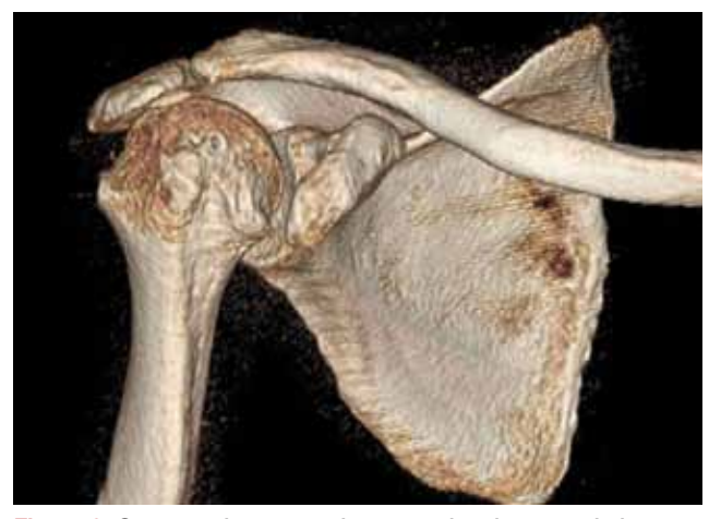
Figure 3. Computed tomography scan, showing osteolytic reaction after revision surgery.

cases demonstrated relatively osteoporotic bone with suboptimal fixation.