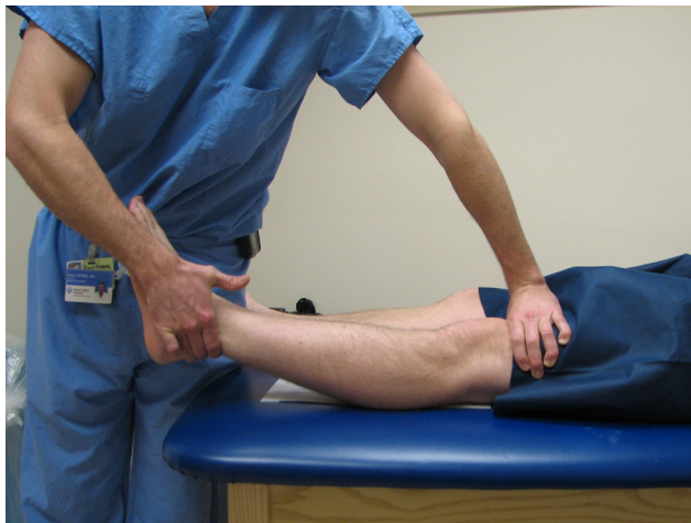
Figure 1. Visual estimation—hyperextension.

physicians experienced in sports medicine repeated this examination in succession. Data were missing from only 1 physician, who failed to examine 1 patient.